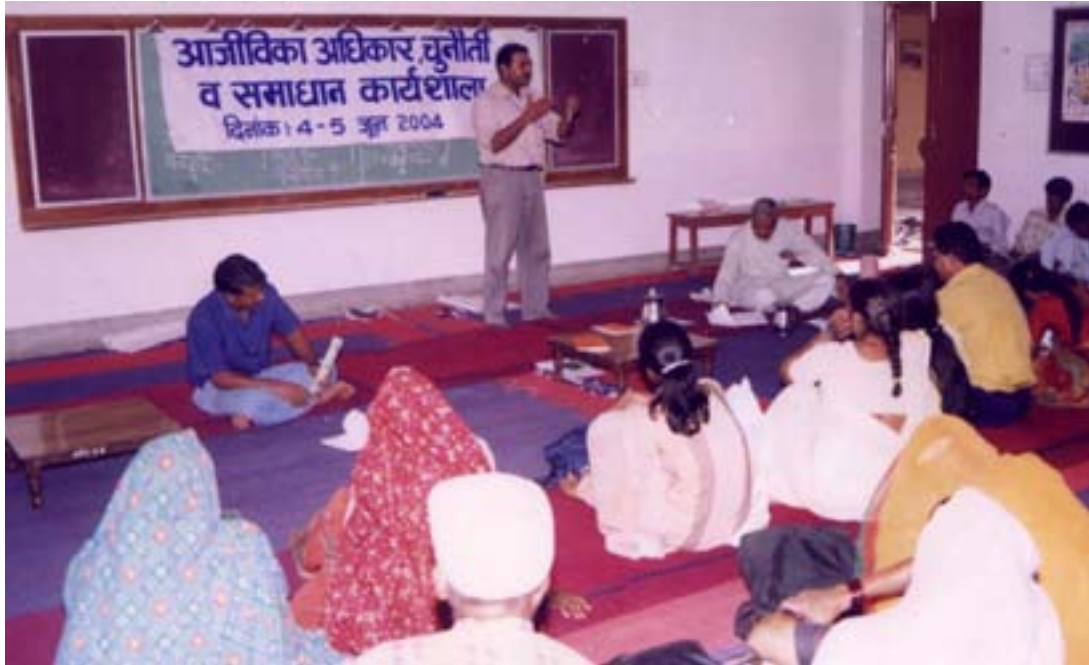
The Livelihood Resource Unit works with an Action – Reflection strategy, with action, followed by reflection on action, followed by more action! Here, a workshop is going on, on Livelihood Rights, Challenges and Solutions, held June 2004.

Also on the issue of employment, the Unit studied the migration patterns in Kotra Block, Udaipur District, and Kumbalgarh Block, Rajsamand District, to understand better the issue of migrant labour in south Rajasthan. This led to a collaborative effort in the making of a VCD film on migrant labour, which has been completed, titled “Between Two Worlds”.