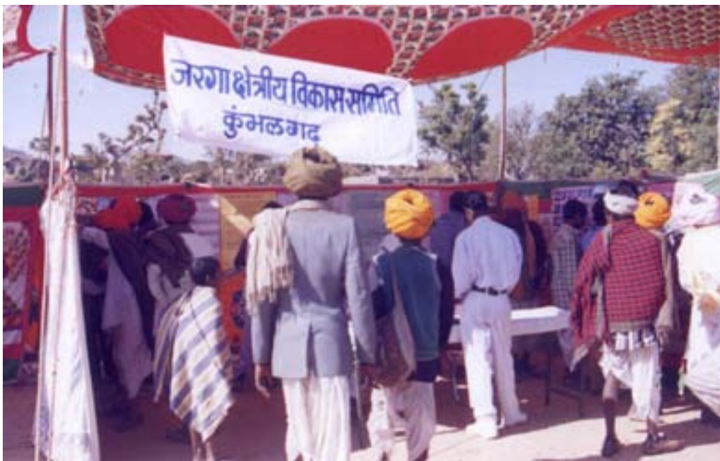
The Jarga Area Development Society, Kumbalgarh Block, Rajsamand District displays posters of the issues and activities that the people have worked on in the last year. This is a Booth, at the annual meeting of the Society.

The work in this area was not as strong in this year as it should have been, due to some staff problems.