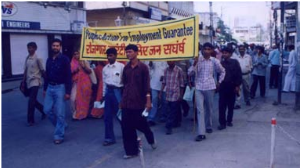
Mass Mobilization around the issue of the Employment Guarantee Bill which was to go before Parliament.

The second major national campaign in which the Livelihood Resource Unit has taken action, is the campaign for the Employment Guarantee Scheme. The EGS forms part of the Common Minimum Programme of the Central Government, and the people's campaign is to help to see that it happens! Astha has helped with signature campaigns, holding meetings and workshops at the village, cluster, regional, levels, and participating in the national level events promoting the EGS. Along with the Drought Struggle Committee in Rajasthan (the Akal Sangherash Samiti), the Mazdoor Kisan Shakti Sangathan (MKSS), Astha organized a state level convention on the issue of the Employment Guarantee Scheme. A national level Workshop was also organized with major input from Astha, in March 2004, in which Rajasthan, Jharkhand, M.P., Delhi, U.P. and Uttaranchal organizations participated (110 people). The focus was in working out how to work on the issues of the Employment Guarantee Scheme, and the Food for Work scheme.