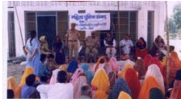
Women and the Police, working together. Ever since the Tribal Women's Awareness Society started working as a community dispute resolution structure, and working on social reform, the police have been supporting their work. To every "case committee" session, the women phone the police station, inform them of the date and place, and ask them to send a constable or two, just to see that no fights break out on the fringes. The police come. Here, in this photo, they are part of a training programme organized for group leaders of the Society.

In addition to this new work, the Society members continue to mobilize both men and women of the area around the issue of forest land rights, improved prices for non-timber forest produce, the Employment Guarantee Scheme and other larger issues. The Society is an important presence, and voice, of the tribal women of the area.