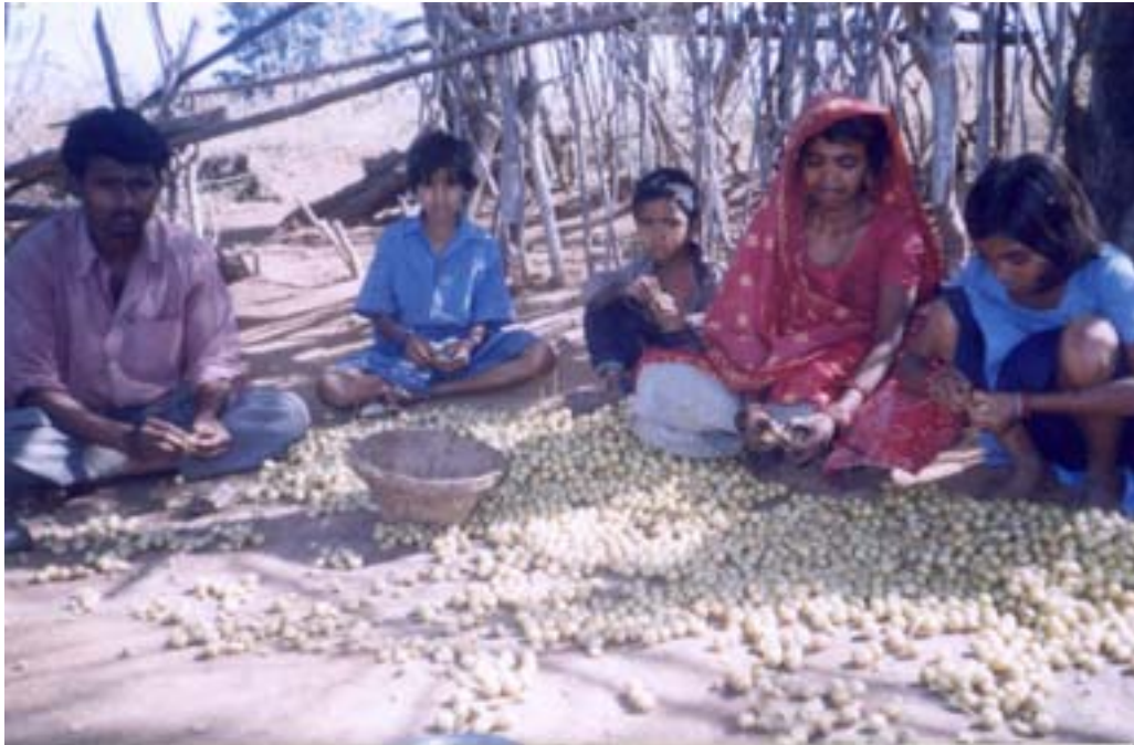
Forest produce collection is a family occupation. Here, a Dungarpur family has collected goose berries, or “awla”, used in jam or pickles, for hair oil, and dried and salted as a digestive. The Support Society helps with market linkages and quality control.

The Support Society is a Federation of non-timber forest produce collectors and processors groups and cooperative societies. At present the Support Society has 5 Cooperatives and 35 minor forest produce groups as members. The Society has also taken up a UNDP project, with 20 Self Help Groups (SHGs) in 4 Blocks of Udaipur District (Kotra, Gogunda, Jhadol, Salumber). A baseline survey was conducted in each of the 20 villages. Later, all the SHGs under the UNDP project were provided with a sum of Rs. 10,000 each as revolving fund, and 10 groups used it to buy forest produce collected, which was later sold for a higher price. 10 groups used the funds for consumption loans, to be returned at 2% interest.