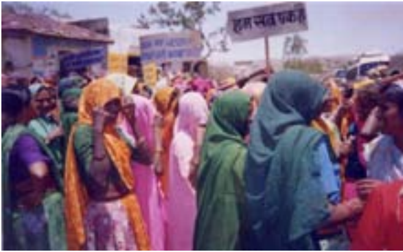
Members of the Tribal Women's Awareness Society, preparing to take out a Rally – The words on the placard are: "Hum Sub Ek Hai" -- "We Are All United!"