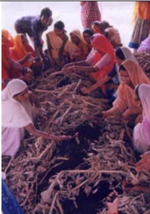
Women’s and men’s groups visit the vermiculture project work of the Shuche Campaign, and learn how to begin a vermiculture project in their own villages. They can earn from the sale of worms, which multiply very quickly, and can use, and sell, the high quality fertilizer.