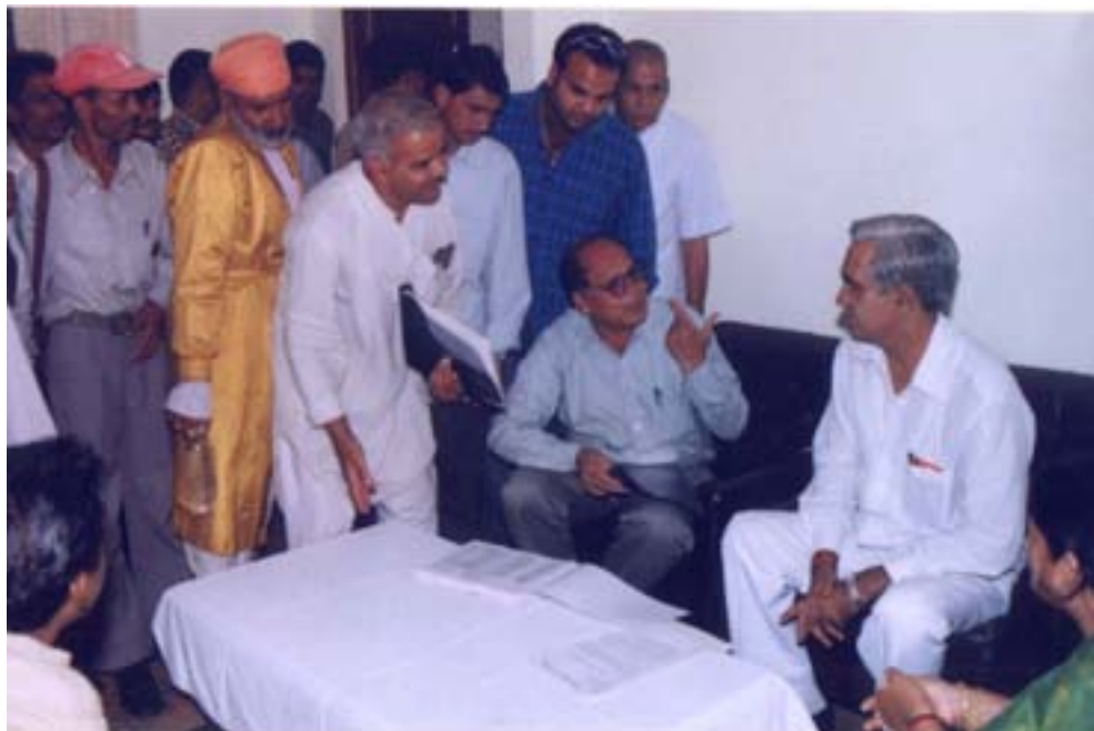
A delegation of the Rajasthan Forest Land People's Movement, meeting with the Central Government Forest Minister in New Delhi, to press for rights to homesteads and non-timber forest produce in Forest Department areas.

Most of the work Astha has done to date has been with Bhil tribals -- Bhil Gameti, Bhil Garasia, Bhil Meenas. In this year, some work was done with the Saheriya tribals of Baran District. Along with SANKALP Sansthan, Astha held a workshop with Saheriya tribals in July 2004, and opened up the issue of Saheriya land rights and forest land rights. There are many cases of non-tribals occupying the lands of Saheriya tribals, and Astha helped over 1,000 Saheriyas file land cases in the revenue courts. The contact with the tribals of that area continues.