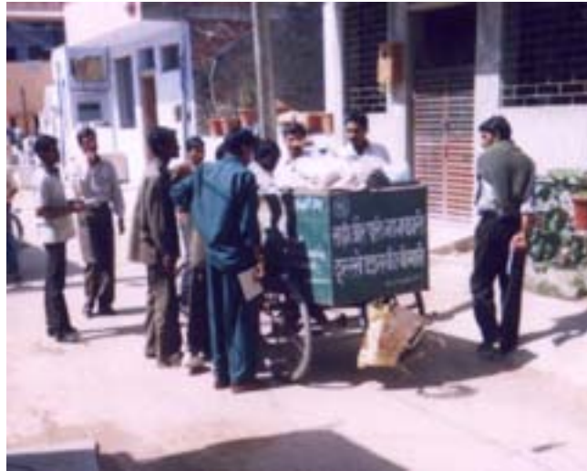
Environmental sanitation – households become members of the Shuche Campaign by paying Rs. 40 per month. They agree to sort their waste into “compostable” and “non-compostable” categories. The three-wheel tricycle of the Shuche Campaign worker goes door to door, and collects both types of waste.

Another change in the “Structure” chart, is that the “Shuche Abhiyan” or the Collecting and Processing of Urban Household Waste in Udaipur by Vermiculture Processes, has become an independent Registered Society. It is no longer a project of Astha, although there are historical linkages which continue. The project makes money from the sale of the vermiculture, and from the monthly membership fees paid by each neighbourhood household, to have their garbage picked up and taken away.